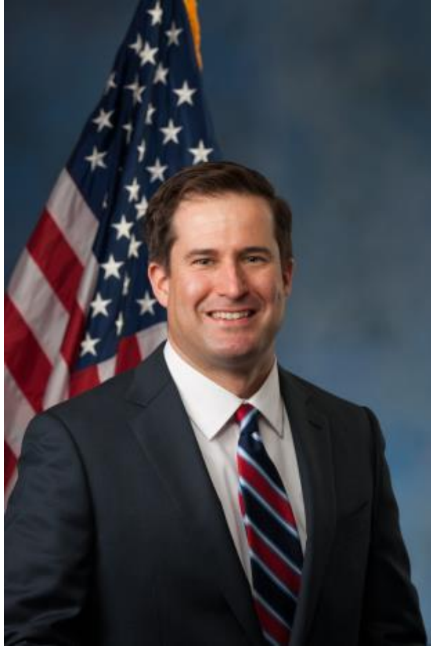
Seth Moulton- U.S Representative for Massachusetts's 6th congressional district

"I expected violent assault on democracy as a US Marine in Iraq. I never imagined it as a United States congressman in America. We're sheltering together not because of a foreign terrorist attack, but because of a domestic coup attempt spurred on by rhetoric like that from the President and his supporters -- like Rep. Miller. Make no mistake: They are enemies of America."