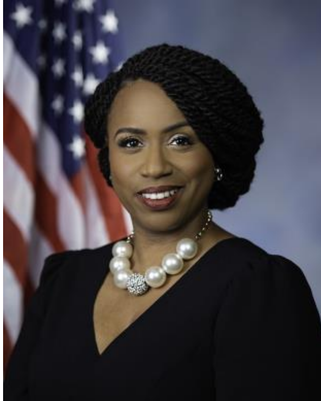
Ayanna Pressley- U.S Representative for Massachusetts's 7th congressional district

“Donald J. Trump should immediately be impeached by the House of Representatives & removed from office by the United States Senate as soon as Congress reconvenes.