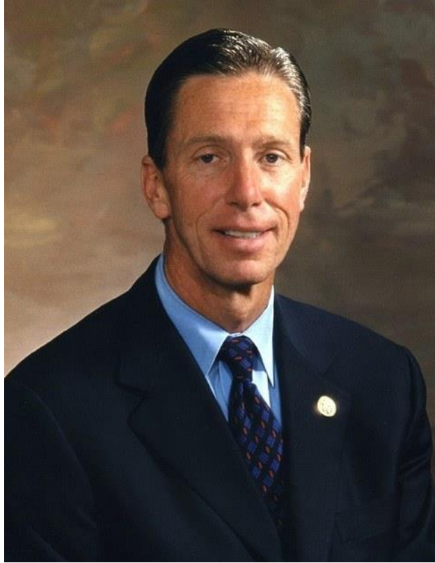
Stephen F Lynch- U.S Representative for Massachusetts's 8th congressional district

“The key moment is when President Trump address them earlier today and told them to get up to the capitol and that's when all the groups from all those areas converged on the capitol he instigated this whole effort to disrupt Congress.”