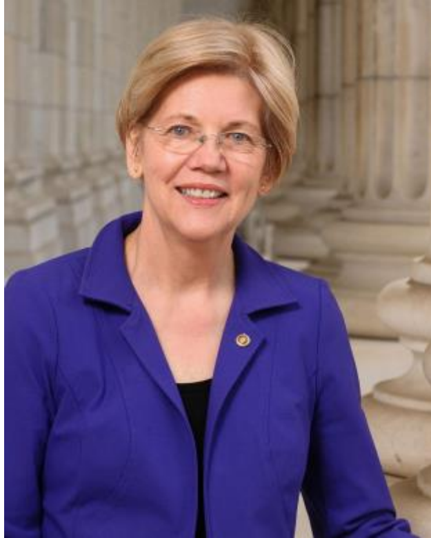
Elizabeth Warren- Massachusetts Senator

“This effort to subvert our democracy is not merely one last Presidential tantrum. This effort is designed to knock out the basic pillar on which democracy is founded —the idea that the voters, not the sitting President and not the members of Congress — but the voters decide who will lead this nation”