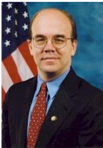
James P McGovern- U.S Representative for Massachusetts's 2nd congressional district