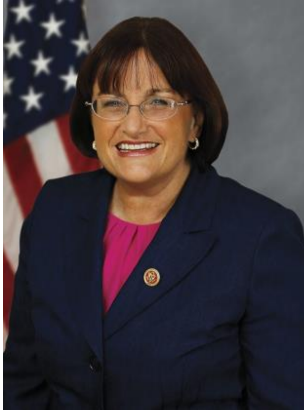
Ann M Kuster- U.S Representative for New Hampshire's 2nd congressional district

“We did not believe that the country was safe with Donald Trump as president having just incited this violence and this attack on our democracy, and we felt that the country would be safer with Vice President Mike Pence at the helm” when asked what the process and idea was behind impeachment “