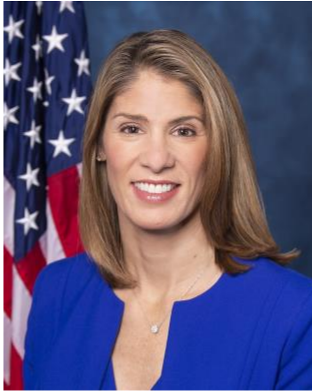
Lori Trahan- U.S Representative for Massachusetts's 3rd congressional district

“What [Donald Trump] has done to this country, what he has done to our democracy - how he has shredded our Constitution — is unforgivable.”