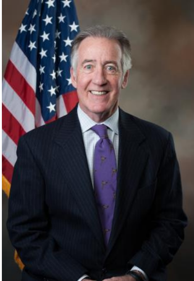
Richard Neal- U.S Representative for Massachusetts's 1st congressional district

“[Donald Trump] clearly incited that mob yesterday,”